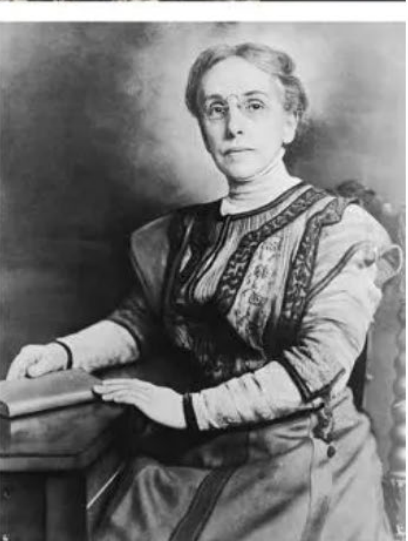
n in education oft overlooked. VARIOUS