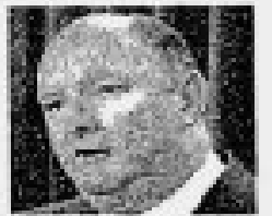
Marlin Fitzwater White House spokesman