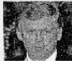
Vice President Dan Quayle