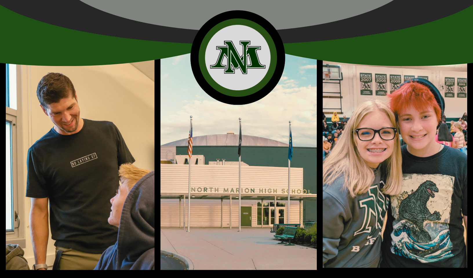
NORTH MARION HIGH SCHOOL

North Marion, learning together to cultivate lifelong growth.