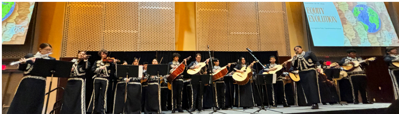
Springfield High School Mariachi del Sol performing at the Equity Summit in September